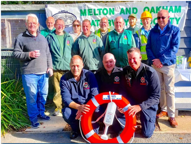
A few of our volunteers with some of our supporters

Following the recent successful launch of rowing boats on the River Eye, Melton & Oakham Waterways Society held an event to thank some of the organisations who have helped make the project a reality and discuss plans for next year.