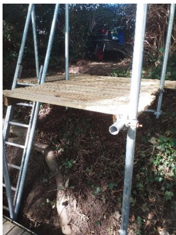
New decking and ladder

As the picture shows, there is now a flat deck and a permanent ladder to allow our volunteers to move equipment to and from the pontoon.